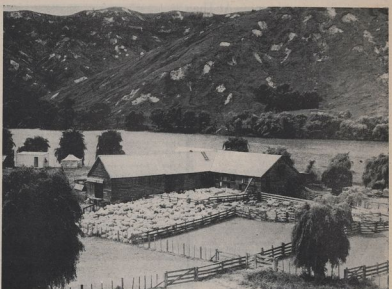
SHEARING TIME AT LAKE TUTIRA. —The lakeland shearing sheds at Tutira will pull wool the second half of last year's flock.