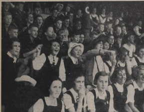
AMONG THOSE PRESENT. —A large number during the progress of one of the events at the Napier Intermediate School sports meeting.