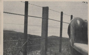
SAFETY FIRST FOR THE MOTORIST. —The new layout of the steep and dangerous Dunlop Hill on the Napier-Waikanae main road has been found with reinforced concrete pipe and steel cables.