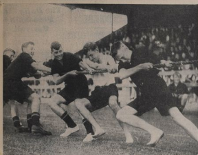
A LONG PULL. —The boys register determination in their tug-of-war bout at the Napier Intermediate School sports.