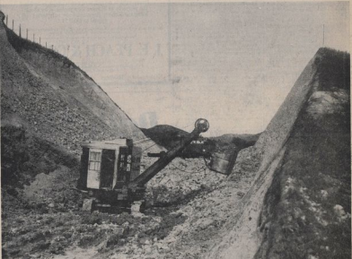
A SUPER-SHOVE. —One of the giant mechanical shovels at work on a cutting which obviates several dangerous bends about eight miles south of Waipara on the Napier-Waikanae road.