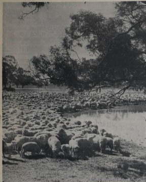
WOOLGATHERING —Sheep on their way to the shearing sheds. An important element in the harvest of the land.