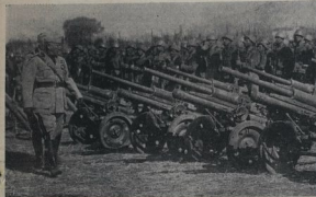
MISBOLINI ON PARADE —While pigs are considered to be unclean parts of the world, it would be hard to see how handsome and clean to be kept. He said it does in a recent parade of Italian artists.