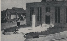
AN ARCHITECTURAL ADDITION TO WAIPARA —Mrs. Innes and garden carefully laid out, the new Government building in Waipara looks a picture of simple beauty of design.