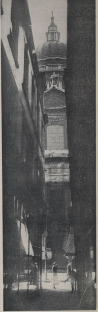
A BROAD STREET IN A PARADISE CAPITAL —The view from the annual race of St. Paul's Cathedral, London, seen from the tower.