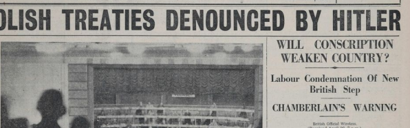
British Official Wishes. (Received April 28, 7 p.m.)

Speaking after the Prime Minister, who moved the Chamberlain's resolution, the speaker said that the Labour Party was determined as anyone else to see that the country's defence was adequate, and that Britain was in a position to fulfil her obligations to prevent war and defeat aggression."