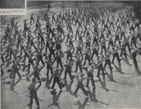
JAPANESE YOUTH MOVEMENT—Members of the Japanese youth movement, which is mobilized throughout on the lines of similar organizations in Italy and Germany, pose a physical culture display at Tokyo.