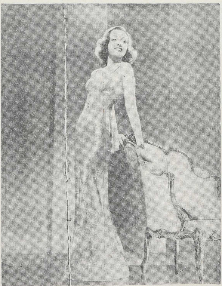
SILVER SILHOUETTE.—The new silhouette is seen in this frock of silver shimmer satin worn by Frances Drake, Columbia Pictures player. Note the cleverly classic simplicity of its sheath fitting lines.