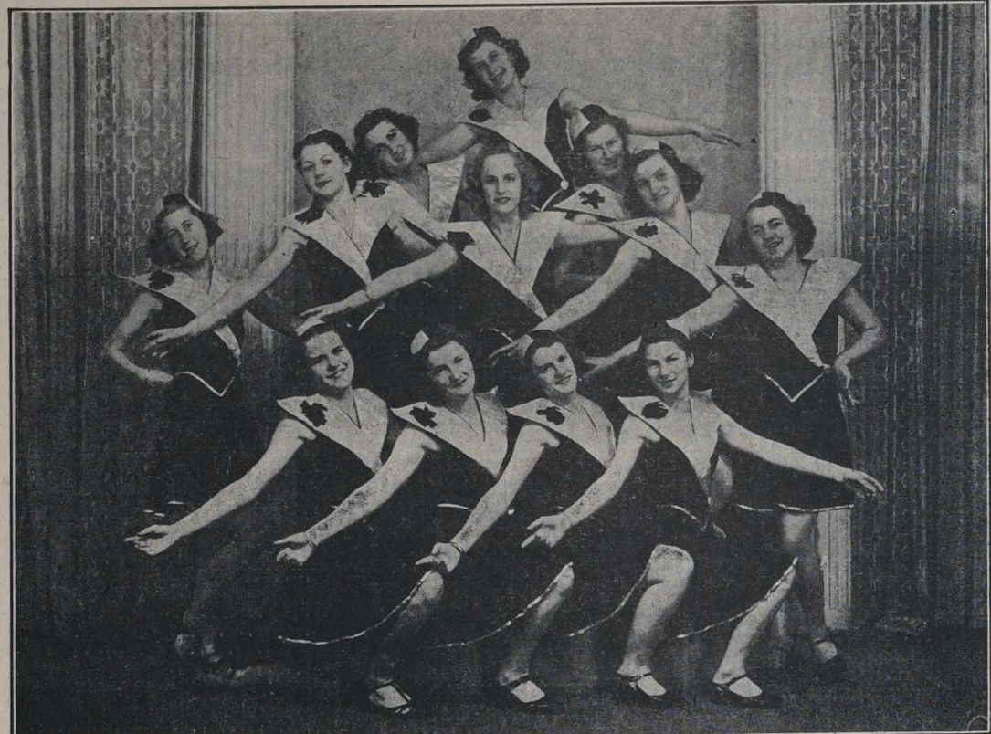
"BOOTS AND ALL" BALLET.—Girls who comprise the ballet, "Franklin D. Roosevelt Jones," a thrilling number in the Napier Operatic Society's colourful musical extravaganza which will be presented at the Hastings Municipal Theatre, to-night.

(Daily Mail Special Service) NUHAKA. The concert given by the pupils of the Nuhaka Native School in the L.D.S. Hall was a performance of outstanding merit.