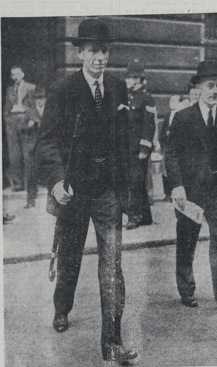
NEW AMBASSADOR.—Lord Halifax, whose appointment as British Ambassador to the United States in succession to the late Lord Lothian, has just been announced. According to broadcast comment, the decision is warmly welcomed in America, where his straightforwardness and sterling worth are fully recognised.