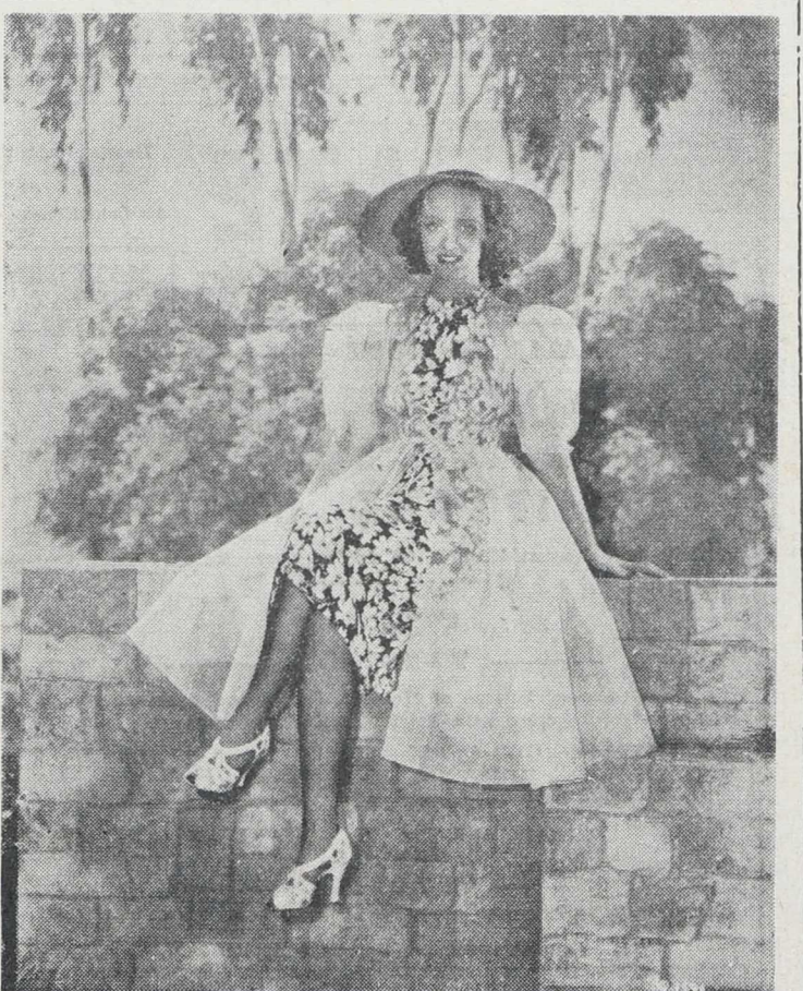
SWING INTO LINEN.—A crisp coat of tailored white linen over a pretty floral frock. The very thing for these summer days, to wear with a large straw hat and smart white suede shoes.

Continental Tour. Before the grim business of the 1938 crisis these travellers were fortunate to be able to make a memorable motor tour of the Continent. They bought a small car which again was fortunate because they struck a rough crossing to Calais, heavy cars on the Channel steamer suffering considerable damage which the small cars escaped. Fine weather favoured the trip which enabled the most enjoyable mode of travelling with picnic meals by the way, excellent roads, comfortable quarters for the nights and the good fortune of no engine or transport trouble. The route taken was through Belgium and Luxembourg to Germany, in which country they spent three weeks. The travellers did not sense anything of the "hymn of hate" against the British, but had noticed considerable military activity at Trier although they saw nothing of the Siegfried Line. The way was made along the course of the Moselle and up the Rhine through the Black Forest and Austrian Tyrol. Travelling along the autobahns was a very fine experience but despite their boasted safety the travellers came upon an accident one day. During their visit