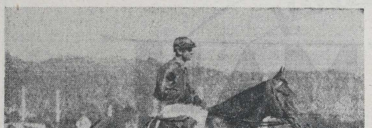
ROYAL CHIEF'S inclusion in the Wellington Cup field provided the handicapper with an easy tonight. The Chief Ruler horse has 9.5, but that will not rule him out of early discussions.