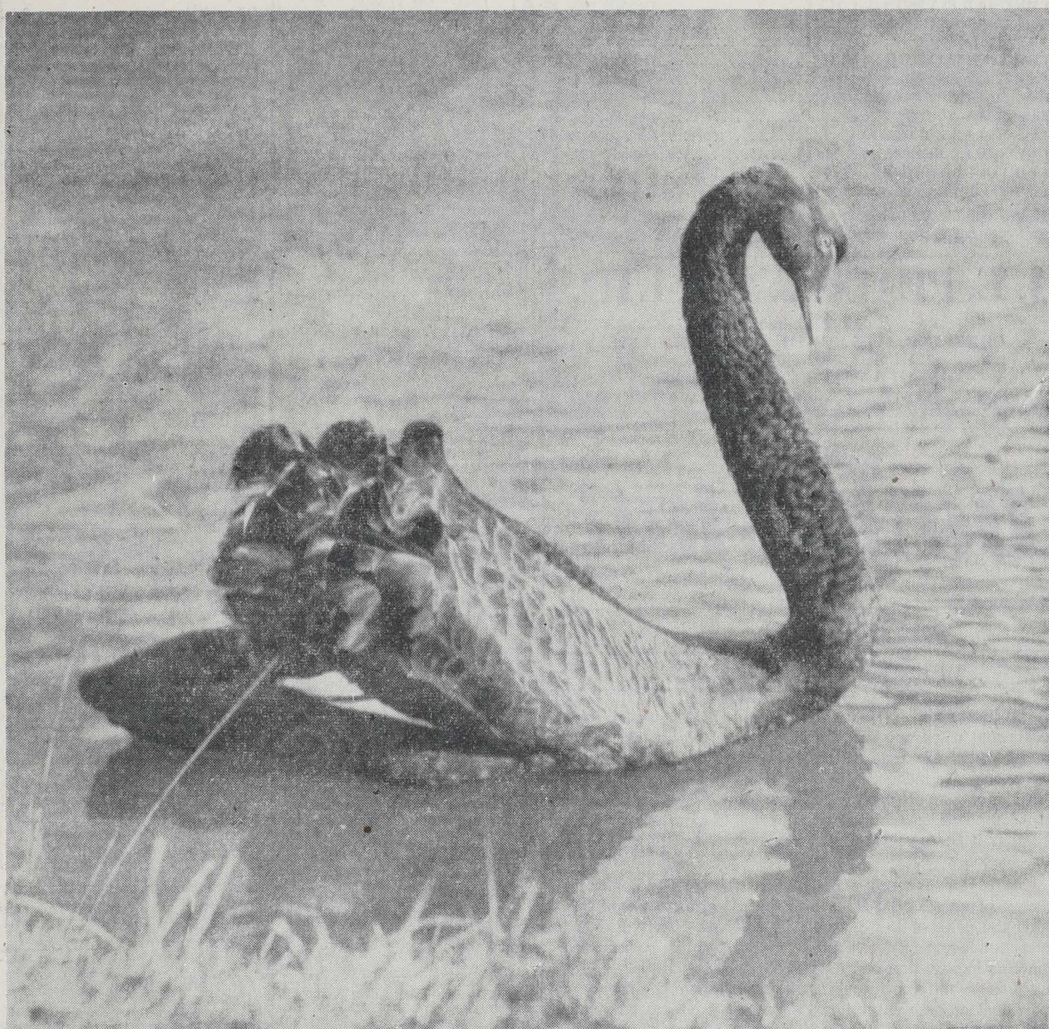
HOW TO KEEP COOL.—Ungainly on land, the swan is the most graceful of creatures in the water. A study in poise and tazy contentment.