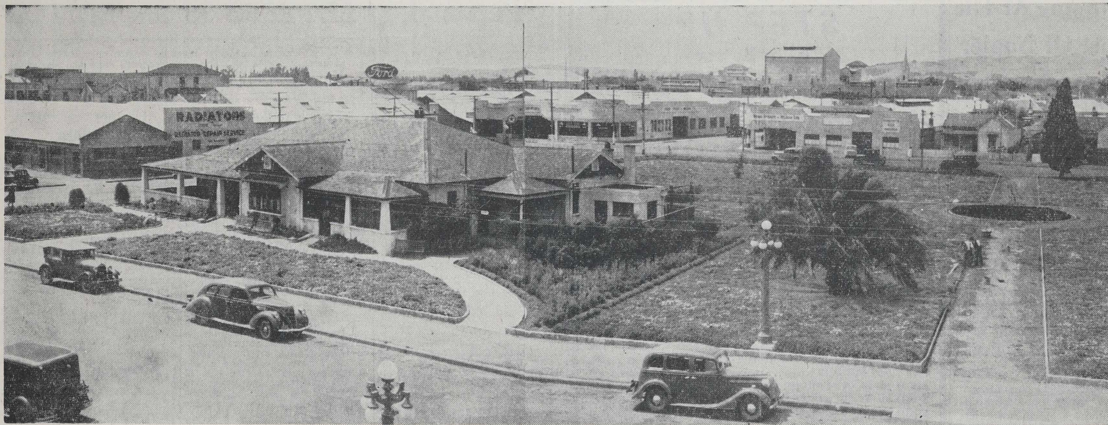
THE CENTRE OF HASTINGS.—An early morning view of the Civic Square at Hastings, showing the Women's Rest situated in its beautiful surroundings.

General Gort's record is especially one to appeal to the soldier in the firing line, for he won his Victoria Cross and other decorations for heroism while only a junior officer in the World War. To see him going about among his troops on front-line inspection tours confirms the first impression that here is a man of action, a man with an eye for essentials with little concern for formality.