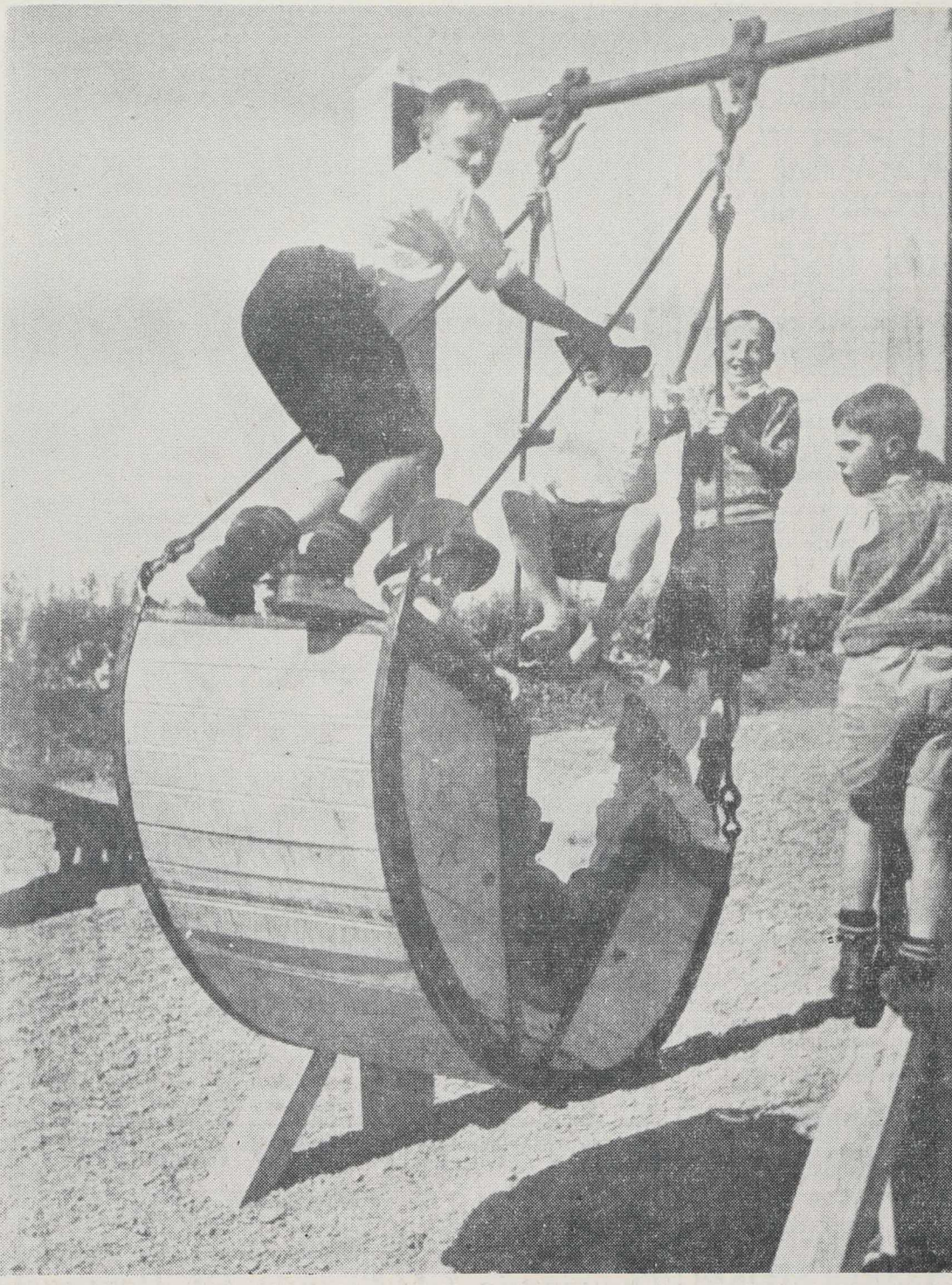
UP AND NEARLY OVER—Boys at play in the glorious sunshine on a Hawke's Bay beach.