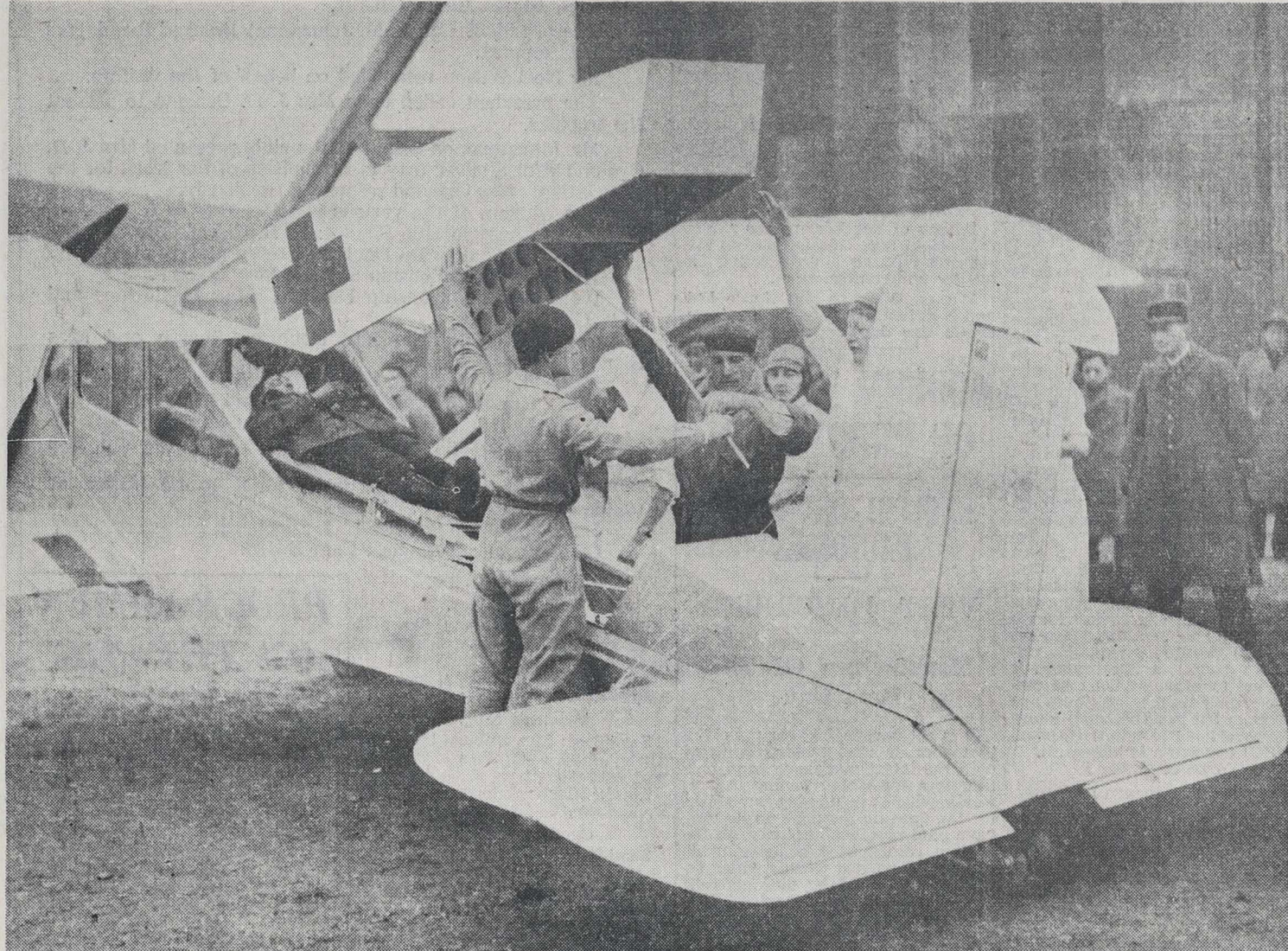
CASUALTIES BY AIR.—Typical French thoroughness is seen in this picture of the method adopted by the French Air Force to carry urgent cases by air. Special nurses are trained to look after the patients in transit.

The British Air Ministry announces that Coastal Command machines attacked three enemy destroyers off Horn-reefs (25 miles off the coast of Jutland) on January 11, when bombs were seen to explode close to the destroyers. The 'planes suffered no damage.