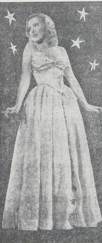
LOOKING BACKWARD: Looking back into the future's fashion we see this lovely evening gown reminiscent of grandmother's day.

To keep your copper ware well polished rub it over with tissue paper occasionally.