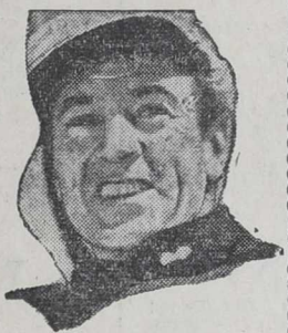
DON'T MISS A SINGLE THRILL WITH "BEAU GESTE" FROM THE START!

A roaring lusty tale of the indomitable gallantry of three loyal brothers will be portrayed at the Regent Theatre, Hastings, where Paramount's great new production of "Beau Geste" is opening to-day with three sessions.