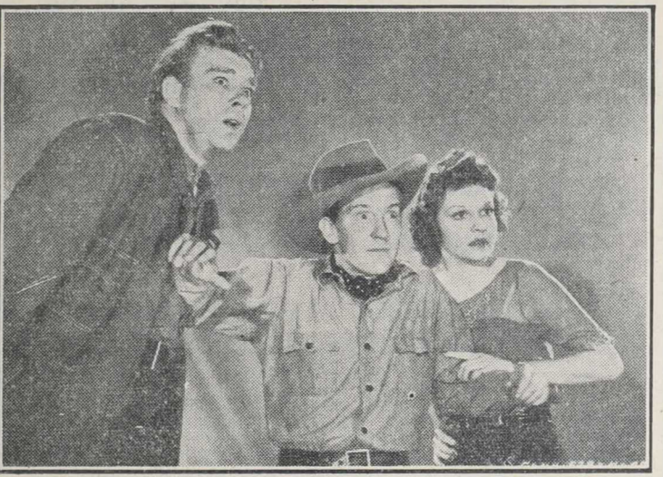
Betty Field, Burgess Meredith and Lon Chaney, jun., in a tense and dramatic scene from "Of Mice and Men," Hal Roach's film version of John Steinbeck's famous novel. The film will be screened at the State Theatre, Hastings, next Friday.

"How did you manage to get it ready so quickly?" she asked. On leaving the studios, the queen was given a good send-off by studio employees and by crowds which had waited patiently outside the gates to see her.