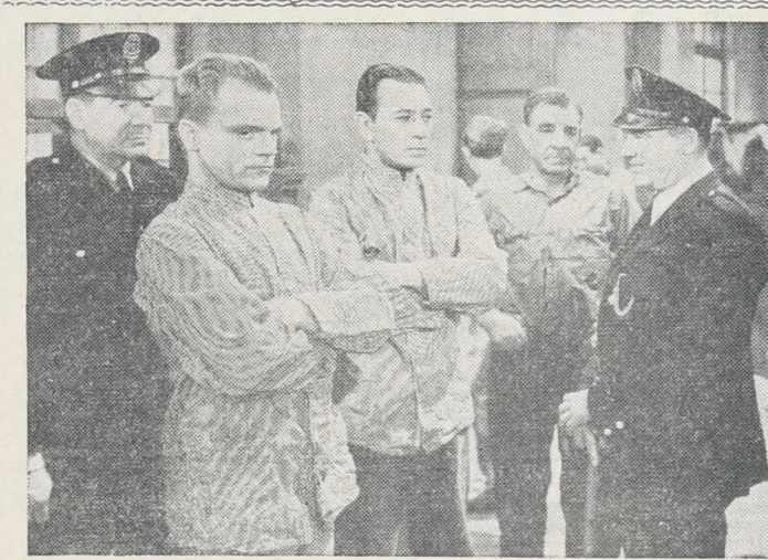
James Cagney and George Raft have the leading roles in "Each Dawn I Die," a powerful film of prison life, the current attraction at the Cosy Theatre, Hastings. George Bancroft and Jane Bryan are also in the cast.