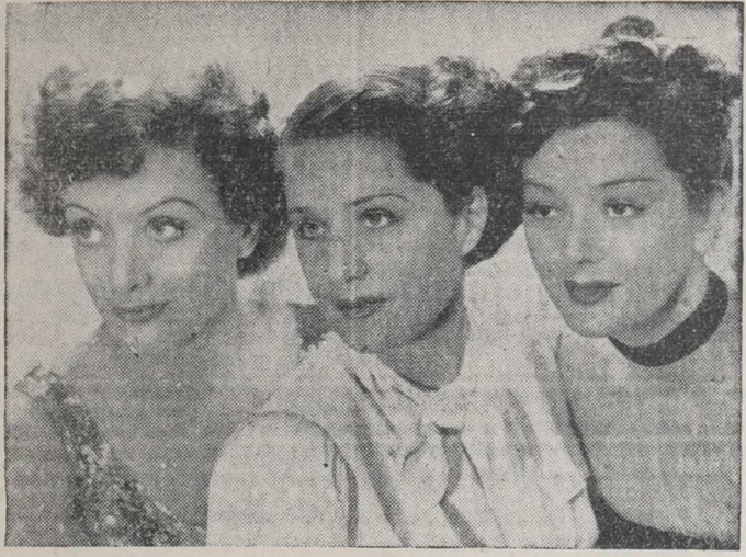
Starring Norma Shearer, Joan Crawford and Rosalind Russell, "The Women," picturisation of Clare Boothe's great Broadway success, opens a season at the Regent Theatre, Hastings, to-day as one of the outstanding productions of the current year. More than 130 women comprise the characters of the story, with not a man in the cast.