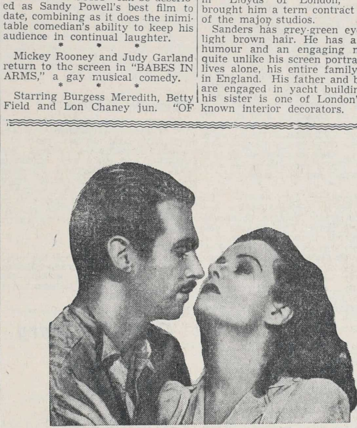
Douglas Fairbanks, jun., and Joan Bennett are co-starred in "Green Hell," a great dramatic film which is now showing at the Regent Theatre, Napier.