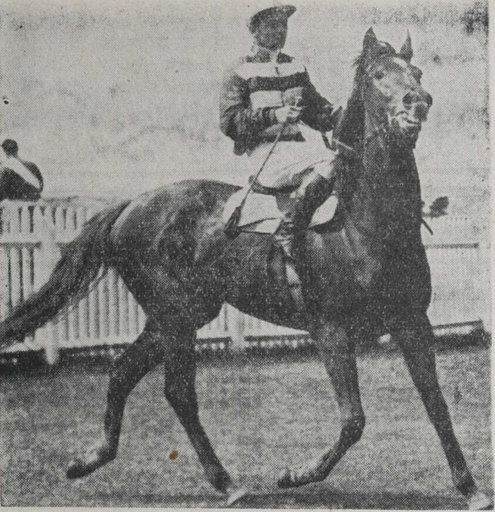
ENDORSEMENT showed her wing for the Hastings track by beating a smart field of sprinters in the Heretaunga Handicap on Saturday. She won well and paid a good price.