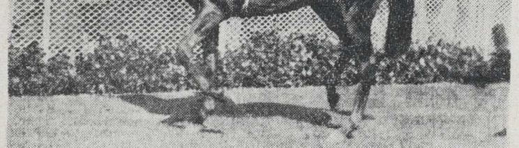
BEAULIVRE was unlucky in losing the rich Doomben Newmarket Handicap, but he made no race of the Doomben Cup on Saturday, establishing track-record time.

ARABO and Kaiwaka led over the first fence, but Arabo was joined across the top by Jewelled Girdle and the pair set a solid pace. Lengths clear of Kaiwaka, Heskettown, Soho, Clarion Call and Aussie Ra. Except that Student Prince improved his form, there was no change in the straight and when they went on to the turn Jewelled Girdle and Arabo were bowling along two lengths