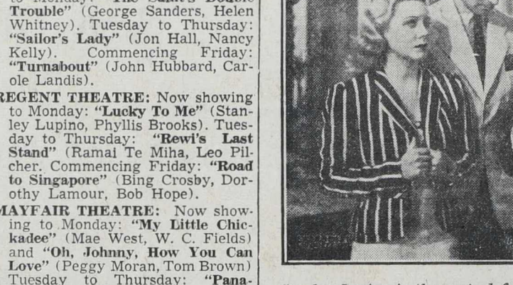
Stanley Lupino is the central figure in this amusing scene from the sparkling comedy, "Lucky To Me," opening to-day at the Regent Theatre, Napier.