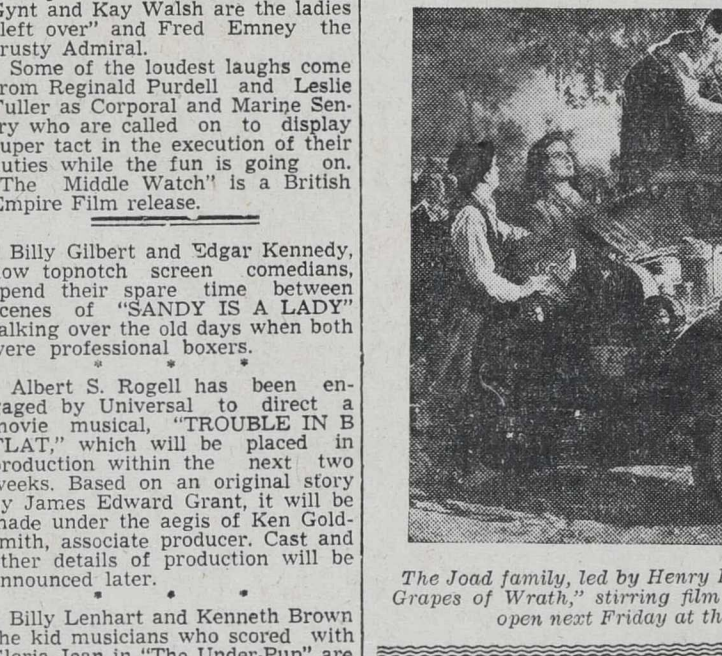
The Joad family, led by Henry Fonda, packs its belongings in "The Grapes of Wrath," stirring film from the great Steinbeck novel, to open next Friday at the State Theatre, Hastings.