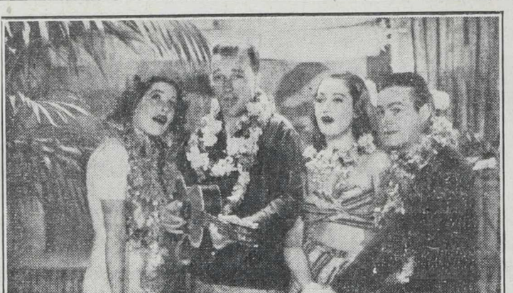
Bing Crosby and Bob Hope with Dorothy Lamour and Judith Barrett in a gay moment from the musical comedy, "Road to Singapore," now at the Regent Theatre, Hastings.