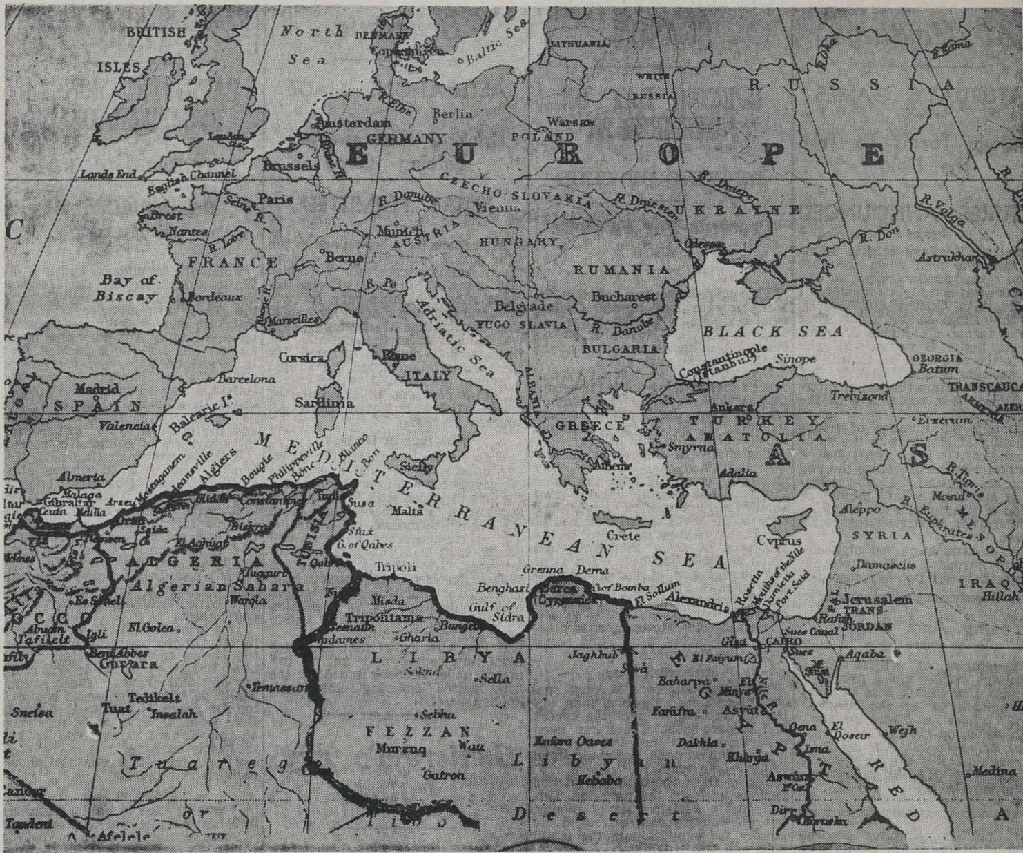
WAR IN THE NEAR EAST—This map, covering the whole of the Mediterranean area, indicates clearly the significance of the recent German moves in the Balkans. The virtual German capture of Rumania brings the Nazi forces into control of the Danube delta on the Black Sea coast south of Odessa. This move has seriously alarmed Russia, as it is a direct German threat to Istanbul, the Dardanelles, and the Aegean Sea, between Greece and Turkey. The map also shows the scene of the Italian advance along the north African coast from Libya into Egypt.

"It is regrettable that there are five serious cases connected with the driving of cars," said his Honour. "One would have hoped that cases of this sort would decrease. You will find that in four of them there is evidence that the accused person had been taking alcoholic liquor before the accident occurred." The Judge added that the duty of the Grand Jury was simply to find where there was a prima facie case.