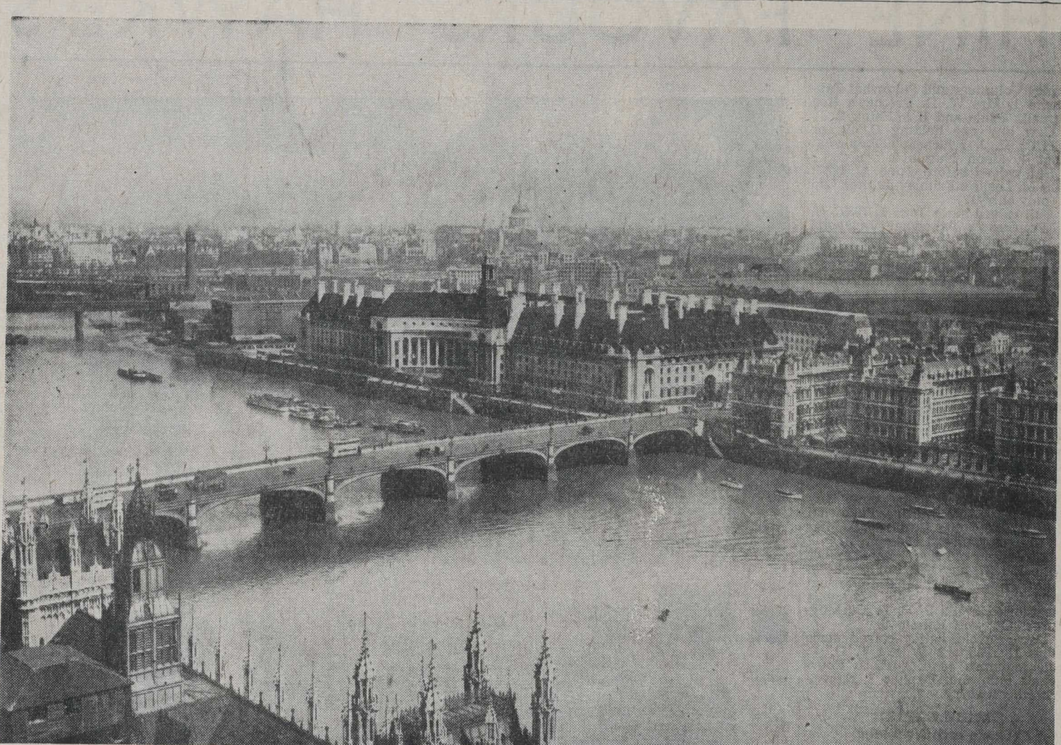
TARGETS FOR NAZI BOMBERS IN THE HEART OF LONDON.—This splendid panorama, photographed from the Victoria Tower of the Houses of Parliament, shows some of the most notable landmarks of London and Westminster which have been severely damaged by recent bombing. Westminster Bridge crosses the Thames with, on the opposite side, the London County Hall on the left, and St. Thomas's Hospital on the right. Behind these buildings can be seen the vast expanse of Waterloo Station. Waterloo Bridge is just out of the picture to the left. Past Waterloo Bridge the Thames sweeps round in a wide arc and flows through the city near St. Paul's, the dome of which can be seen in the distance.

Witness said that if a man were to say that witness had given him a cheque for £996 and told him to bank it in the accused's account, the witness would say that was the first he had ever heard of a suggestion. It was quite untrue for the accused to suggest that he had used certain moneys in his possession to recoup gambling losses. Further suggestions put to him as coming from the accused witness described as pure fiction. The accused had admitted from the first that she was entirely to blame, witness said. The cross-examination was not completed when the hearing was adjourned.