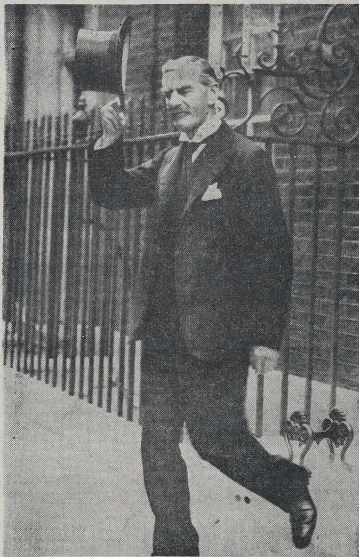
THE RT. HON. NEVILLE CHAMBERLAIN

An Air Ministry news bulletin describes how 25 Junkers dive-bombers were seen by a force of Hurricanes fleeing for France only 100 feet above the water, with formations of protecting fighters overhead.