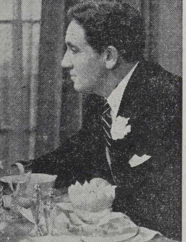
Beautiful Hedy Lamarr with Spencer Tracy in "I Take This Woman," finely-told romance now at the Regent Theatre, Hastings.

Members of the 1st Light Horse Machine Gun Regiment became film actors in the Botany (N.S.W.) sand hills when they rode over the ridges into a reconstruction of the Sinal Desert village of El Arish which was captured by the Australian Light Horse during the last war.