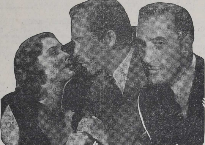
Basil Rathbone as the neurotic killer of "A Date With Destiny" with Ellen Drew and John Howard in a scene from the film, now at the Regent Theatre, Napier.