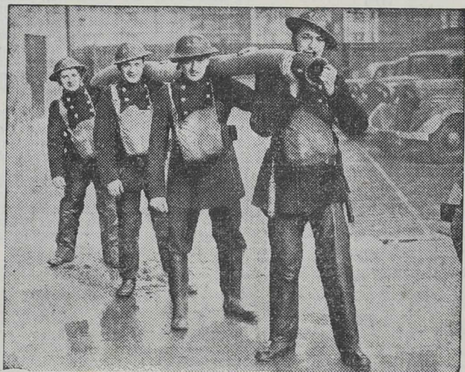
FIREFIGHTERS ON DUTY IN A LONDON STREET.

Berlin claims that German and Italian troops have occupied Bardia. The British War Office says a B.O.W. message, issued the following communication early yesterday morning: "In Libya our troops are in contact with the enemy west of Tobruk."