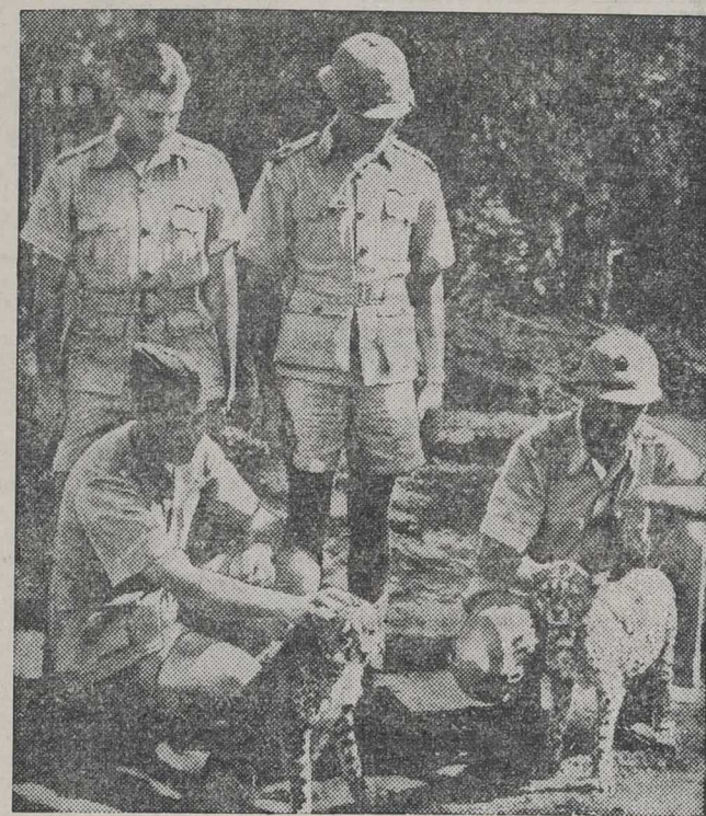
SOUTH AFRICANS' MASCOTS —Two baby cheetahs adopted as mascots by a bomber squadron of the South African Air Force in East Africa. Units of the South African force are now taking part in the battles on the Egyptian—Libyan frontier.

(3) Advanced training by Maxwell, Moffat and Randolph fields, but this does not include combat training. Officials emphasised that British flyers were expected from all parts of the Empire. They will enter the schools as civilians and not as members of the R.A.F. in order to comply with the United States law.