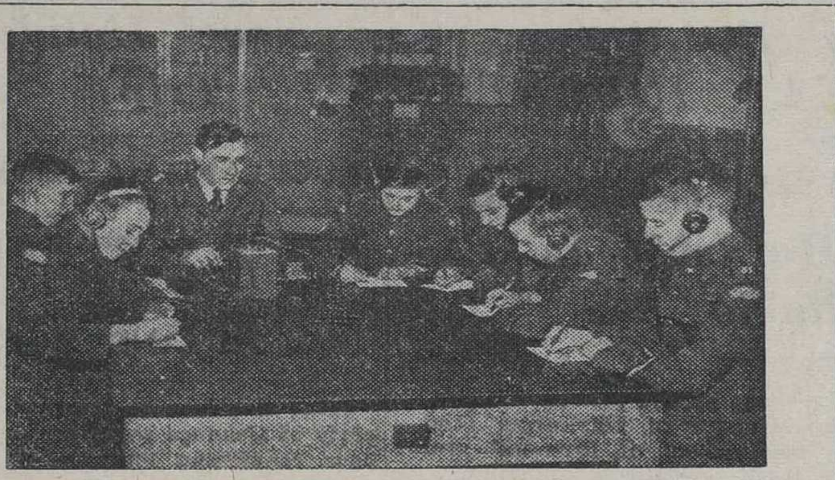
AIR-TRAINING IN SCHOOLS.—Ripon Grammar School, Yorkshire, has its own aeroplanes and workrooms for training the boys. A Morse-decoding class is seen at work.

Threat of Internement A new boat, which the party obtained with difficulty, was too slow to travel far under cover of darkness, and the possibility of having to return to Turkey and internment took shape in their minds.