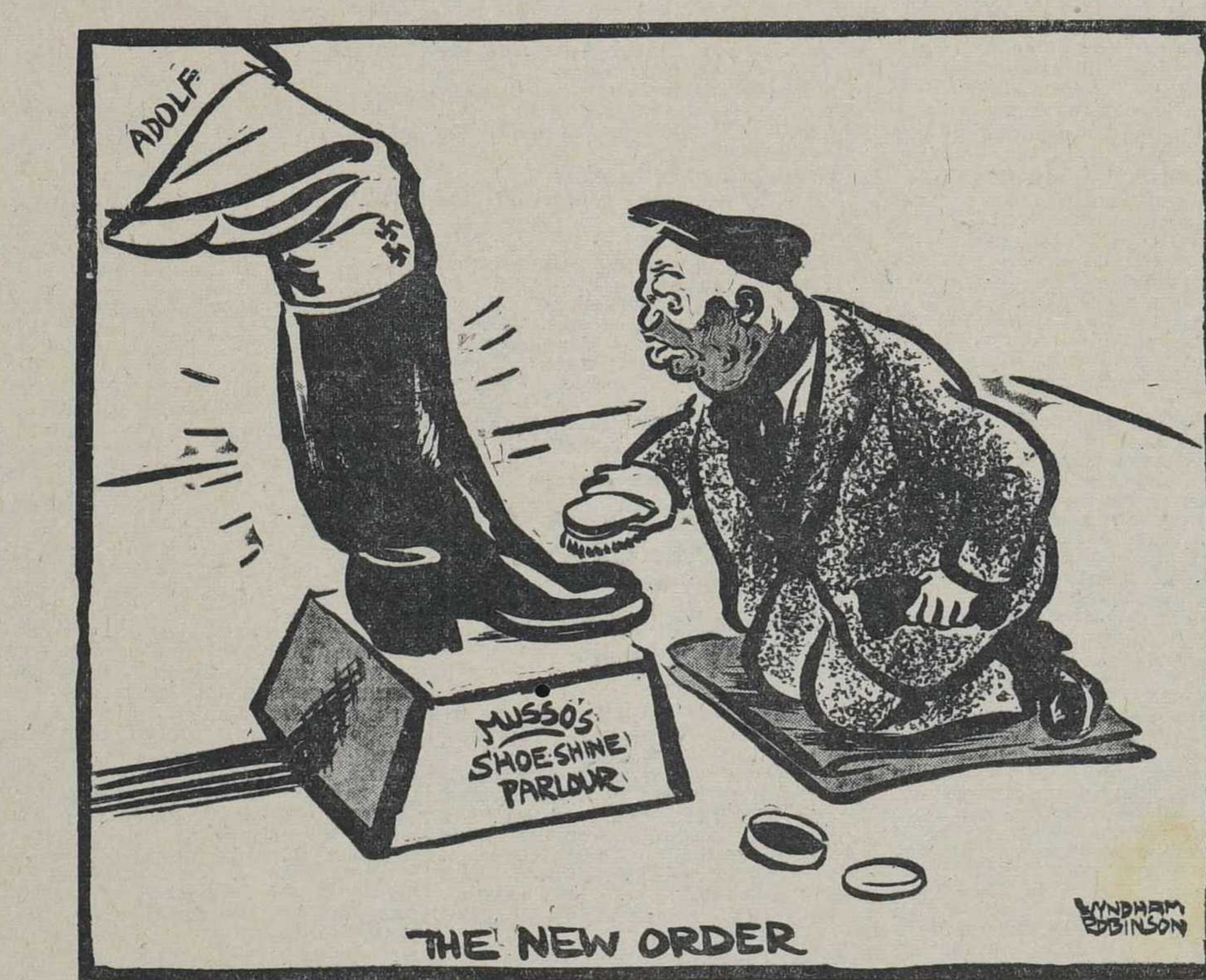
Cartoon from the London Star. Not available in British Isles and India

United Press Association—Copyright. JERUSALEM, May 25. The caves that King Solomon built have been placed at the disposal of the A.R.P. authorities. They could shelter 6000 people.