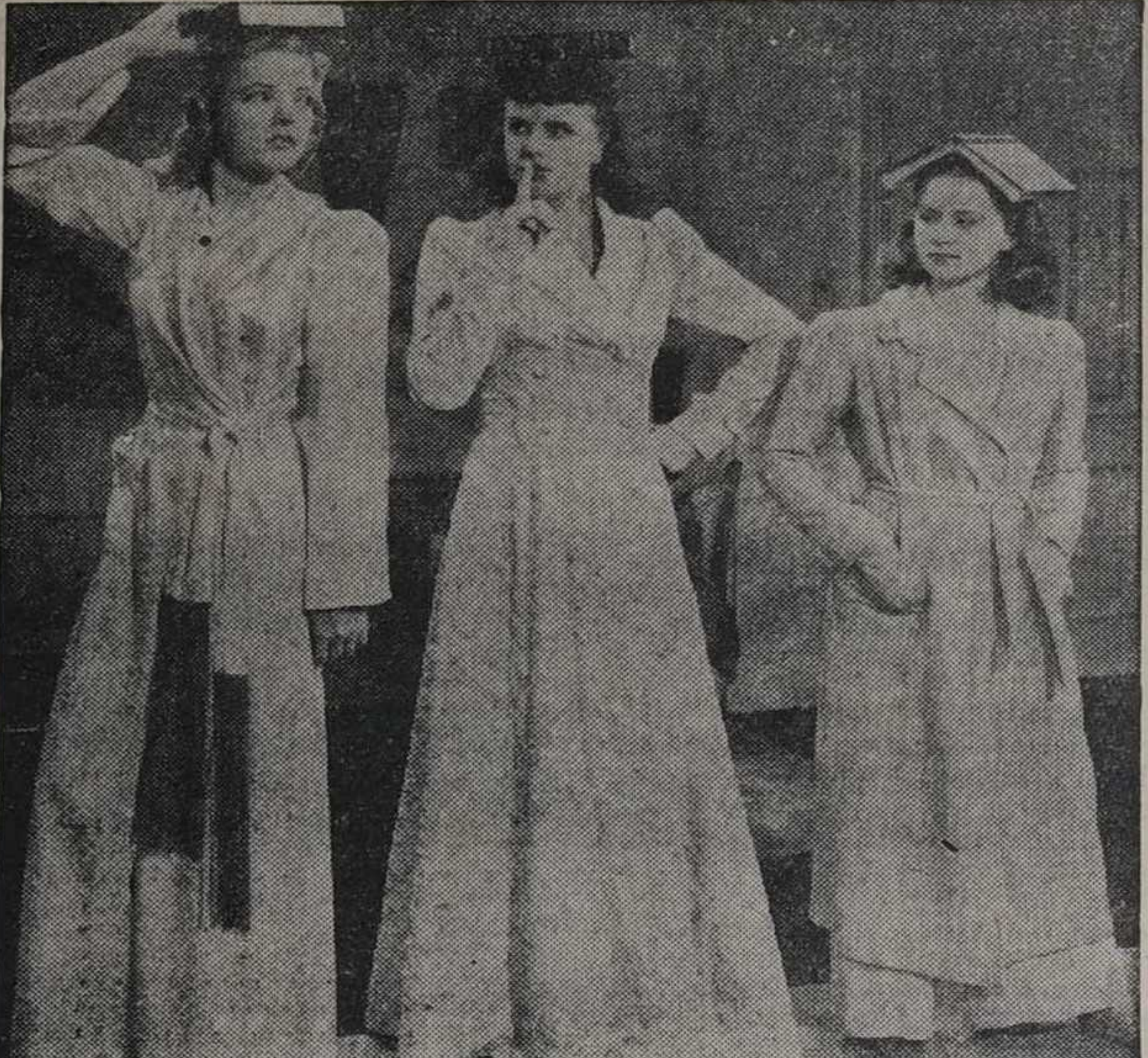
A lesson in deportment for Anne Gwynne, Deanna Durbin and Ann Gillis in 'Nice Girl?', which will open at the Regent Theatre, Napier next Friday.