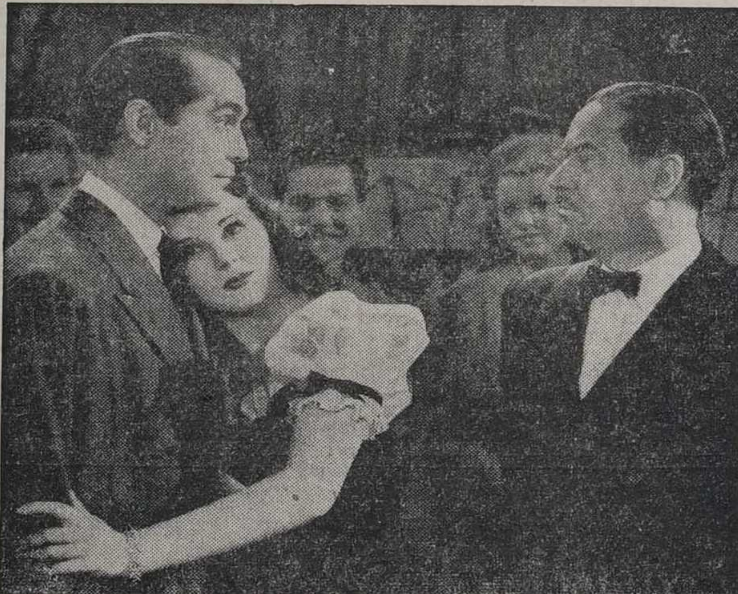
Franchot Tone, Deanna Durbin and Robert Benchley in an amusing moment from 'Nice Girl?', the popular young singing star's ninth success, which is now at the Hastings Regent Theatre.

Fred Astaire, co-starred with Paulette Goddard in Paramount's 'SECOND CHORUS', has succeeded Adolphe Menjou as 'the best dressed man in Hollywood.'