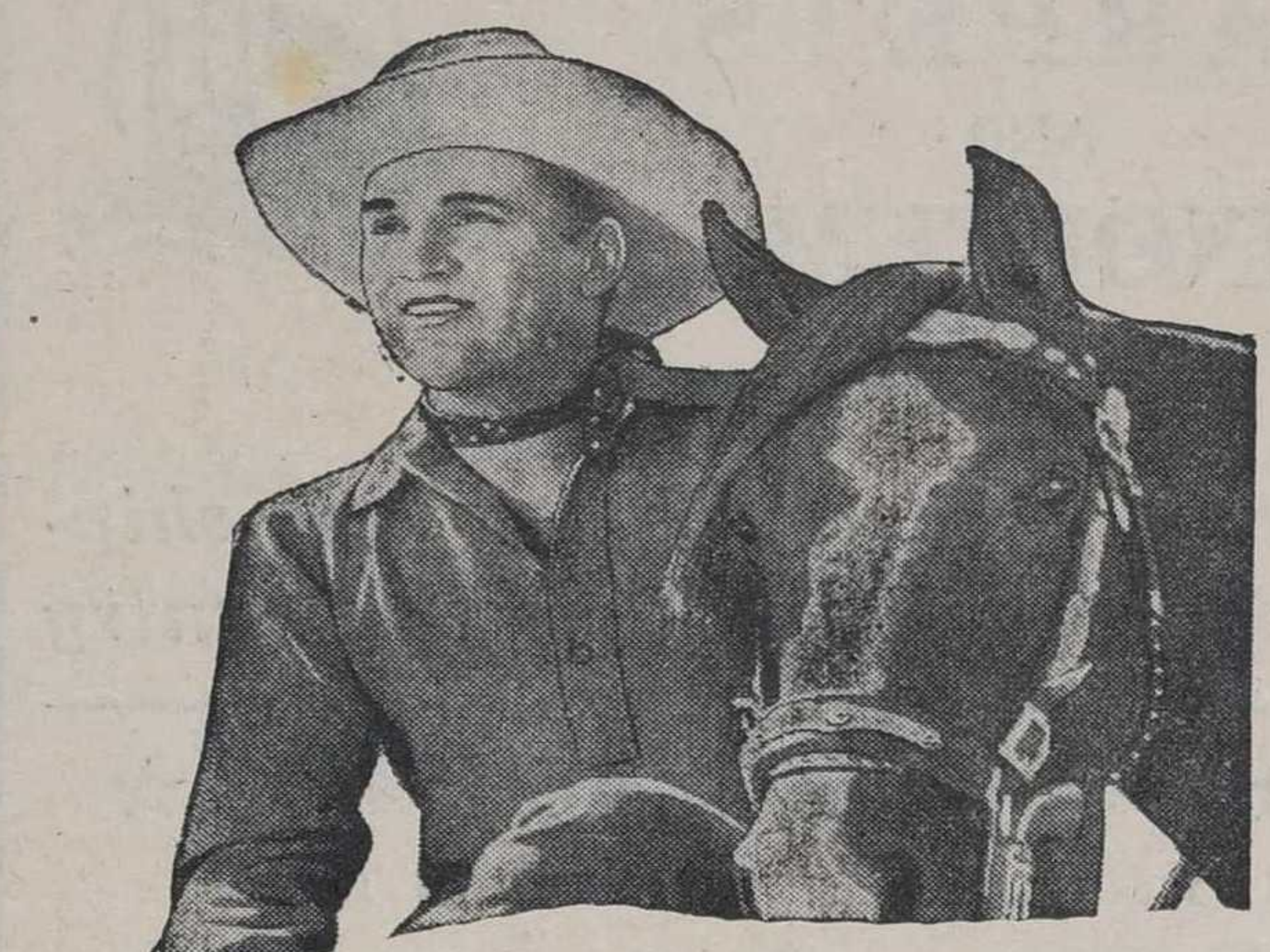
Gene Autry and 'Champion' a familiar 'team' appearing again in 'Riding On a Rainbow,' Western adventure now at the Cosy Theatre, Hastings.

But, while not unmindful of the tribute of the great, Chaplin himself prefers the forms of praise he gets from the little man—laughter!