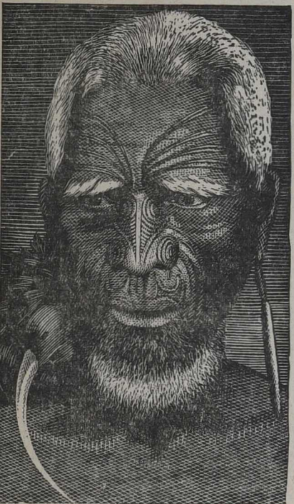
Engraving of Painting by Lindauer in the Portridge Collection at the Auckland Art Gallery.