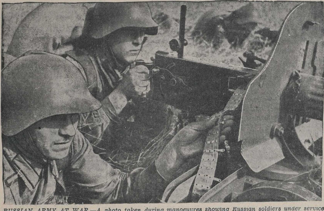
RUSSIAN ARMY AT WAR.—A photo taken during manoeuvres showing Russian soldiers under service conditions.

"Useless to Resist" In a broadcast the Berlin radio told the Russians that it was useless to resist the German attack.