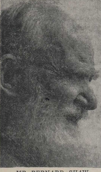
MR BERNARD SHAW

The Vichy radio stated that British naval units are bombarding without interruption the coast between Sidon and Beirut, probably preparing for an offensive by Australian troops.